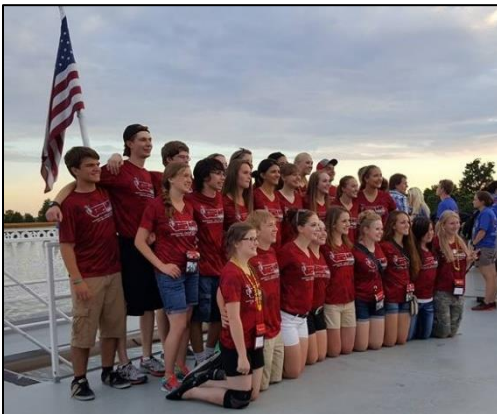
Historic Riverboat Cruise on the Potomac River. Dancing, games, and just chillin'

This is an ALL-EXPENSES PAID trip to Washington DC. Check it out at http://www.nreca.coop/what-we-do/youth-programs/ or check out the Facebook pages MT & ND Youth Tour to DC and 2016 MT-ND Youth Tour.