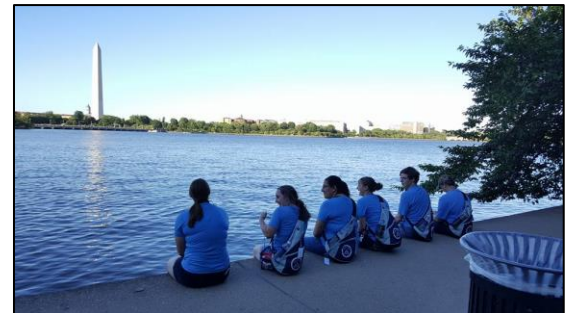
Monuments Tour – enjoying the view