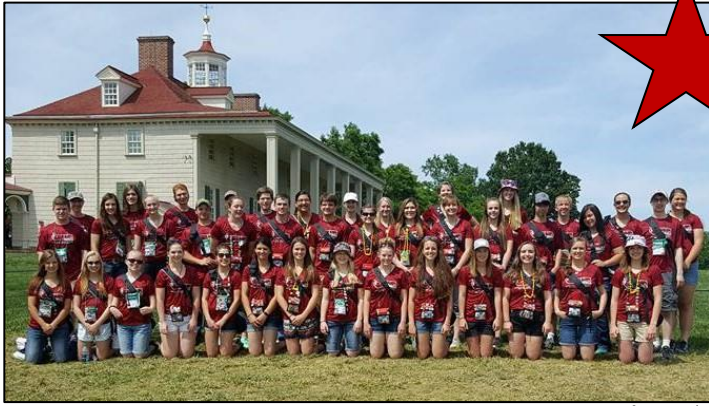
Mount Vernon Tour – Standing where great leaders have stood before us!