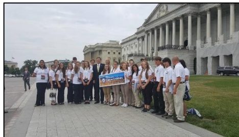
Question & Answer with Senator Daines